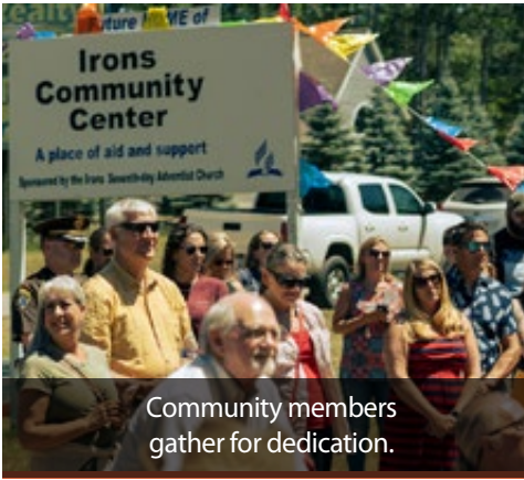
Community members gather for dedication.